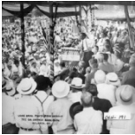
Eugene Talmadge giving a speech in Albany, Dougherty County