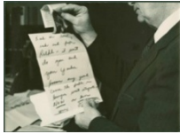
Letter regarding desegregation from an Atlanta Constitution reader, August 1958