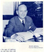
Ellis Arnall, MS 1548 01 02 003