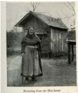
Returning from Hen House, Highways and Byways of the South , MC F 215 J66