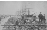
Savannah Dock Workers