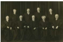
Huges Court 1937 – 1938