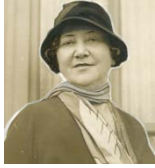
Georgia novelist Corra White Harris