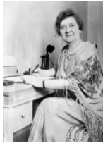
Corra Harris at Desk