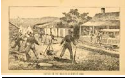
Capture of the train, Daring and suffering: a history of the Andrews Railroad Raid into Georgia in 1862 , Rare Collection, E473 55 P68 1887