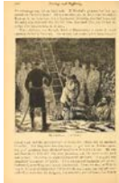
Andrews in chains, Daring and suffering: a history of the Andrews Railroad Raid into Georgia in 1862 , Rare Collection, E473 55 P68 1887