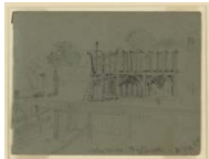
Water tanks Big Shanty W & A Railroad Library of Congress, Prints and Photographs Division, LC-DIG-ppmsca-20204