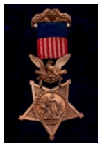
Medal of Honor, WICR 30054