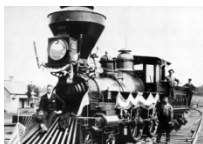
“The General” in Chattanooga