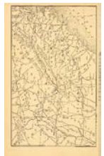
Map of Southern Rail Road system threatened by the Andrews Raid, Daring and suffering: a history of the Andrews Railroad Raid into Georgia in 1862 , Rare Collection, E473 55 P68 1887