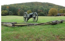
Cannon at Kennesaw

Library of Congress, Prints and Photographs Division, LC-DIG-stereo-1s01404