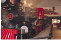
The General Museum Tableau