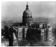
Georgia State Capitol