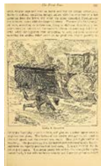
Leaving the Locomotive, Daring and suffering: a history of the Andrews Railroad Raid into Georgia in 1862 , Rare Collection, E473 55 P68 1887