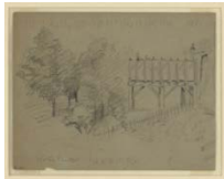
Water Tank W & A Railroad ca 1856