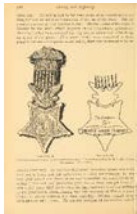
First Medal of Honor, Daring and suffering: a history of the Andrews Railroad Raid into Georgia in 1862, Rare Collection, E473 55 P68 1887