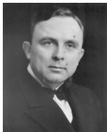
Governor E.D. Rivers