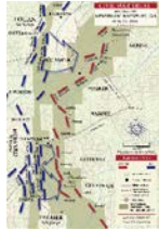
Kennesaw Mountain June 27