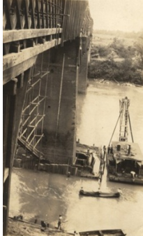
Looking down from the Chattahoochee River Bridge Alabama Department of Archives and History, Montgomery, Alabama