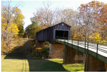
Euharlee Creek built by Son of Horace King 1