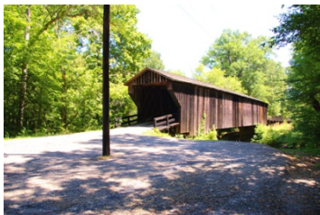
Red Oak Creek Bridge Meriwether County