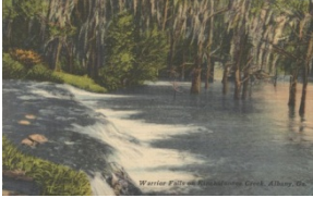
Warrior Falls-Albany, 1361PC-01