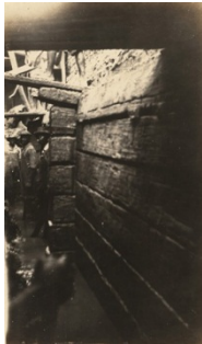
African American laborers Chattahoochee River Bridge built 1833