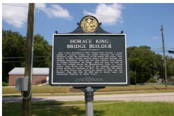
Horace King Historical Marker