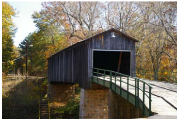
Euharlee Creek Built by Son of Horace King 2