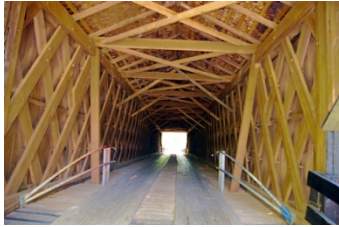
Interior Red Oak Creek Bridge Meriwether county