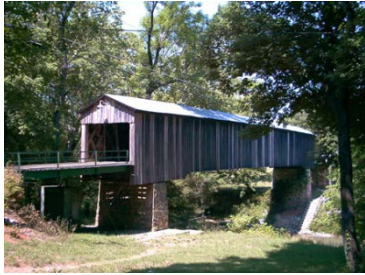
Euharlee Creek built by Horace King Son 3