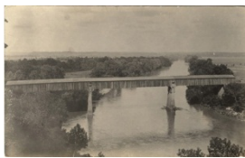
Chattahoochee River covered bridge, Eufaula, AL built 1833

Presented online by the Digital Library of Georgia