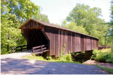
Red Oak Creek Bridge, Meriwether county view 2