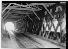
Watson Mill Bridge