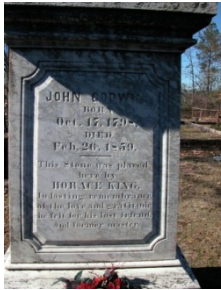
John Godwin grave