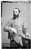
Dashing portrait of Maj. Gen. Joseph Wheeler, officer of the Confederate Army