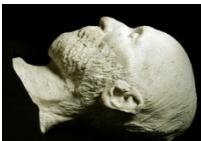
Death Mask of Joseph Wheeler, profile, Artifact Collection, A-1361-269

Library of Congress, Prints & Photographs Division, LC-DIG-cwpb-05987