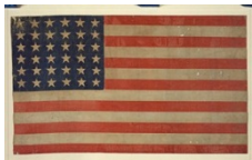
Thirty-six star flag