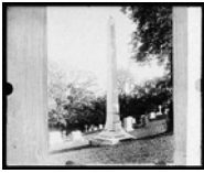
Arlington, Joe Wheeler statue

Library of Congress, Prints & Photographs Division, LC-DIG-ppmsca-21732