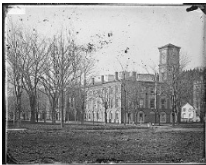
Old Academic Building West Point