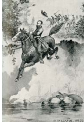
Wheeler on a Horse in Battle

Campaigns of Wheeler and his cavalry, 1862-1865 , Rare Book Collection, E547 W5 D5 1899