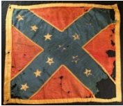
Confederate flag, A2400-001