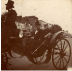
Joseph Wheeler in a carriage