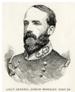
Wheeler at age 28