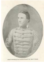
Wheeler as West Point Student