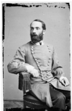
Portrait of Maj. Gen. Joseph Wheeler, officer of the Confederate Army