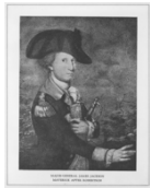
James Jackson, c 1850