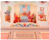
The First Federal Congress 1789 Courtesy of Architect of the Capitol