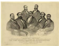
The first colored senator and representatives in the 41st and 42nd Congress of the United States