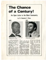
1972 Congressional Campaign Flier Courtesy of the Auburn Avenue Research Library, AJY041