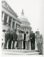
Photo in D.C. during the time Andrew Young was in Congress