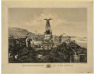
Reconstruction of the South, 1857 Library of Congress Prints & Photographs Division, LC-DIG-pga-02837