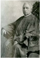
Rev Henry McNeal Turner, Life and Times of Henry M. Turner, Rare Collection, BX8449 T87 P65 1917