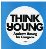
Congressional campaign sticker, 1970s