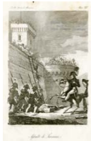
Revolutionary War, Attack on Savannah