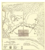
Siege of Savannah

Library of Congress, Prints and Photographs Division, LC-USZ62-11898