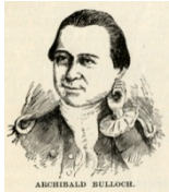
Archibald Bulloch, History of Georgia , Main Collection, F286 E9 1908