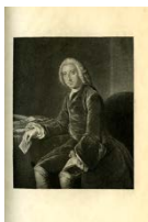
William Pitt, Memoirs of the court of England from the revolution in 1688 to the death of George the Second . Main Collection, DA 480 J58 1908, Volume 1