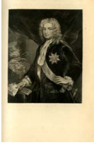
Robert Walpole, Memoirs of the court of England from the revolution in 1688 to the death of George the Second . Main Collection, DA 480 J58 1908, Volume 1