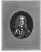
George II, Memoirs of the life and reign of King George the Third by John Heneage Jesse. Main Collection, DA505.J58 1908