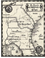
The travels of Oglethorpe in Georgia / drawn by Raiford J. Wood. The Georgia Historical Society Map / Architectural Drawing Collection, 1361MP – 589