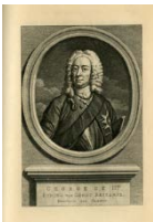
Portrait of George II, Memoirs of the court of England from the revolution in 1688 to the death of George the Second . Main Collection, DA 480 J58 1908, Volume 1