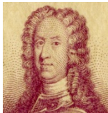
Crop, Oglethorpe Portrait, A-1361-532