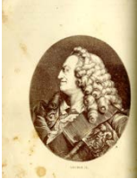
George II, The four Georges: The English humorists of the eighteenth century by W. M. Thackeray Main Collection, DA 483 A1 T33