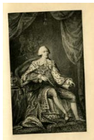
George III Memoirs of the court of England from the revolution in 1688 to the death of George the Second . Main Collection, DA 480 J58 1908, Volume 1