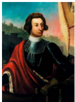
Portrait of Oglethorpe, A-1361-327