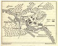
Plan of Battle of Dettingen, Fights for the Flag by Fitchett, William Henry, 1845-1928 Accessed on www.archive.org