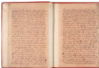
Royal Charter of Georgia, aho07774, page4