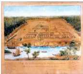
Plan of Savannah 1734, Georgia Historical Society collection of maps, 1500s-1987, 1361MP-001