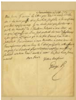
George II letter to unnamed brother, 1752, Manuscript Collection, MS 1260