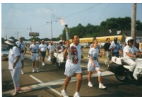
Andrew Young carrying Olympic Torch, 1996