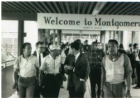
Martin Luther King, Jr. in Montgomery, Alabama, 1960s