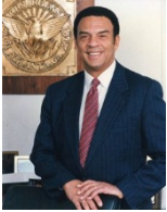
Mayor, 1980s Courtesy of the Auburn Avenue Research Library, AJY016