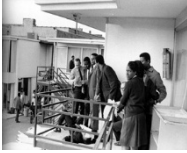
Assassination Of Martin Luther King, Jr.