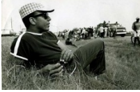
Andrew Young, Selma March, 1965