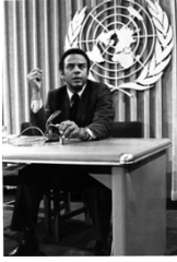
Ambassador Young, at the United Nations, late 1970s