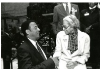
Andrew Young with Rosa Parks, Gubernatorial Campaign, 1990