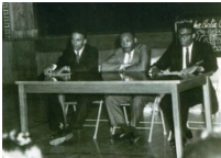
Martin Luther King, Jr., 1960s AJY003