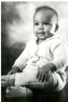
Andrew Young as a baby, 1932