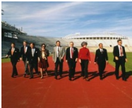
Atlanta Olympic Host City Day, William Porter Payne, 1990 Courtesy of the Auburn Avenue Research Library, AJY020