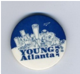
Mayoral campaign button, 1980s, Young for Atlanta