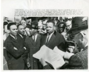
Court order halting Selma march, 1960s Courtesy of the Auburn Avenue Research Library, AJY005