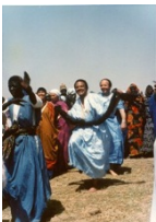
Unidentified place in Africa, Andrew as ambassador, late 1970s