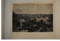
Atlanta, Georgia, After Destruction, Showing Trains