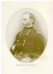
General William T. Sherman