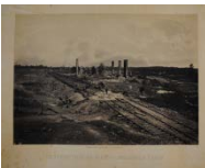
Destruction of Hoods ordinance