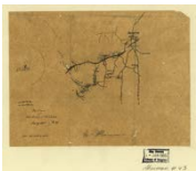
Union Troops, Outside Atlanta, July, 1864