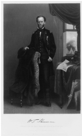
Sherman, full-length portrait, facing front, right hand holding hat on back of chair