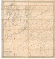
Map of Northern GA, 1864