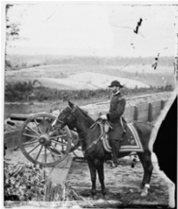
Atlanta, Georgia, Gen. William T. Sherman on horseback at Federal Fort No