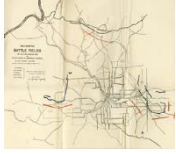
Map of Atlanta