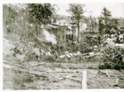
Troup Hurt House during the Battle of Atlanta