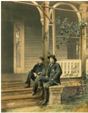
Union Officers on porch