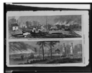
Moving out of Atlanta

Courtesy of the Georgia Historical Society, Main Collection, Battle of Atlanta, E476 7 C750