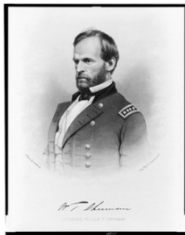
General William T. Sherman, head-and-shoulders portrait, facing left

Courtesy of the Library of Congress, Prints & Photographs Division, LC-DIG-stereo-1s02511