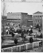
Atlanta, Ga. Trout House, Masonic Hall, and Federal encampment on Decatur Street Courtesy of the Library of Congress, Prints & Photographs Division, LC-DIG-cwpb-03304