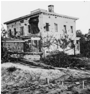
The shell-damaged Ponder House Courtesy of the Library of Congress, Prints & Photographs Division, LC-DIG-cwpb-02229