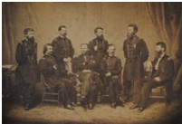
Sherman and His Generals