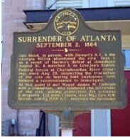
Surrender of Atlanta, historical marker