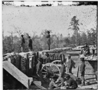
Atlanta, Georgia, Sherman's men in Confederate fort east of Atlanta Courtesy of the Library of Congress, Prints & Photographs Division, LC-DIG-cwpb-03400