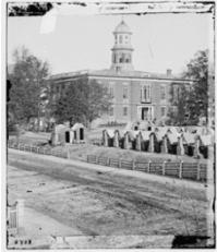
Atlanta, Georgia City Hall; camp of 2nd Massachusetts Infantry on the grounds Courtesy of the Library of Congress, Prints & Photographs Division, LC-DIG-cwpb-02215