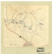
Union Troops, North of Atlanta, July, 1864