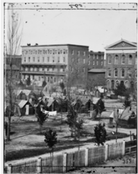
Atlanta, Georgia Trout House, Masonic Hall, and Federal encampment on Decatur Street