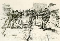
Destroying railroads in Atlanta