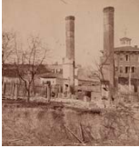
Ruins of Atlanta, GA