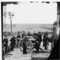
Atlanta, Ga. Gen. William T. Sherman, leaning on breach of gun, and staff at Federal Fort No