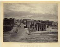
City of Atlanta, Ga., no 2