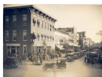
Broadway, Downtown Columbus ca 1920