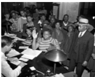
Negroes register primary, Atlanta 1944