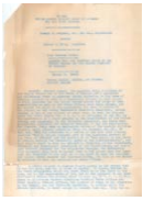
Primus King Court Doc