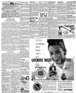
"Primus King Day", Atlanta Daily World, May 21 1953