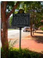
Thomas Brewer historic marker