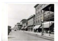
Broadway, Downtown Columbus ca 1920