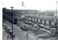
Kinfolk Corner, 1940s Augusta