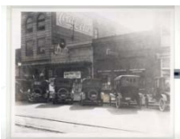
12th street Columbus ca 1920