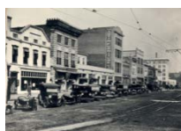
Downtown Columbus ca 1920