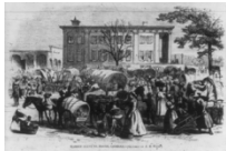
Market Scene in Macon, Georgia

A plan of the town of Macon, Bibb County, Georgia: laid off according to an act of the legislature of December, 1822. Georgia Historical Society Map Collection, MS 136-MP 135