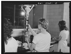
Production of the pertussis vaccine, 1943