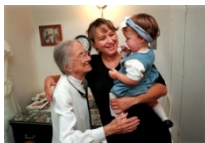
Leila Denmark shares hug with mother and baby