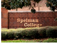
Spelman College sign