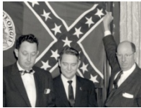
Sponsors of 1956 Flag

Section 2. All laws in conflict with the provisions of this Act are hereby repealed. Approved February 15, 1956.