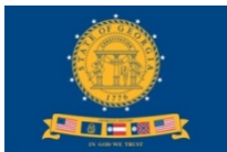
2001 Georgia Flag