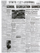
“School Segregation Banned” The Topeka State Journal, May 17, 1964, A1