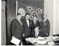
1956 Georgia Flag Signing