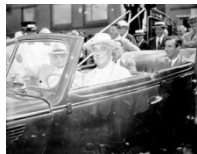
President Roosevelt in Atlanta in car, LBP39-135a