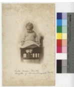
Carson as a toddler, seated reading a book