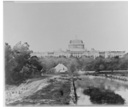
The U.S. Capitol under construction, 1860 Civil War-Era Photographs, compiled ca. 1921 - ca. 1921 , Still Picture Records Section, Special Media Archives Services Division (NWCS-S), National Archives at College Park, MD