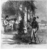
Great Labor Question, 19th & Early 20th Century Labor Prints, 1863-1908 Special Collections and Archives, Georgia State University, Atlanta