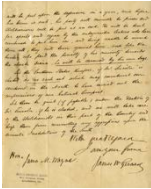
James Moore Wayne Signature, James Moore Wayne papers 1848-1863, MS 845