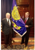
Roy Barnes and Cecil Alexander, creator of Georgia Flag, 2001