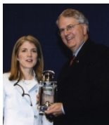
2003 Profile in Courage Award, Roy Barnes