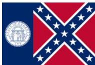
State Flag of Georgia (1956-2001)