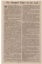
No Stamped Paper to be Had