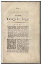
Stamp Act, London printed by Mark Baskett, 1766 Library of Congress Manuscript Division