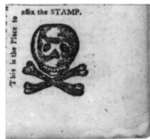
This is the place to affix the stamp