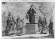
The statue or adoration of the wise men of the West