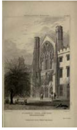
St Stephens Chapel, East Front, The history of the ancient palace and late Houses of Parliament at Westminster