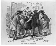
The Stamp Act Denounced