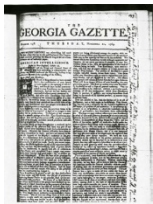
The Georgia Gazette , Thursday Nov 22, 1765