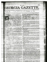
The Georgia Gazette , Thursday Nov 14, 1765