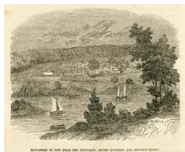
Savannah in the year 1778, Print Collection, 1361PR-03-10A-04