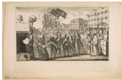
Political Cartoon, The repeal or the funeral of Miss AmeStamp