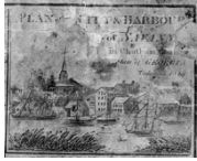
Plan of Savannah and Harbor, 1818 Detail, Map Collection, 1361MP-006 V2