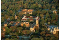
Central Campus, University of the South