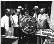
Ellis Arnall campaign for governor 2, 1942