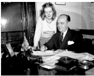
Ellis Arnall as Attorney General, 1940