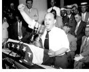
Ellis Arnall campaign for governor, 1942