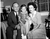
Ellis Arnall and family, 1941