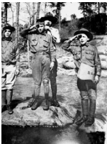
Ellis Arnall as Boy Scout