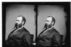
Rufus Bullock 1860