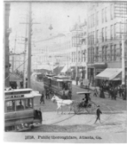
Public Thoroughfare ATL 1896