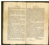
"Message to the Special Session of the Provisional Legislature February 16 1870"