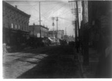
ATL Business District 1900