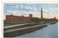
Sibley Cotton Mill