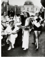
Cafe Scene, Century of Progress, COP_17_0010_00303_002