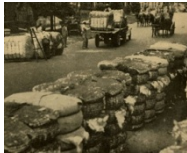
Augusta Farmers Market