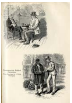
Reconstruction Political Discussions, The story of reconstruction , E668 H516