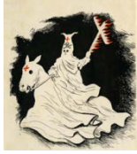
KKK Cartoon, Authentic history, Ku Klux Klan, 1865-1877, Main Collection, E668 D26 1924