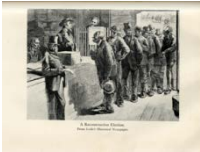
Reconstruction Election Freedmen, The story of reconstruction , E668 H516

Library of Congress, Prints and Photographs Division, LC-USZ6-120