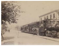
Coast Line Railroad train, ca 1890