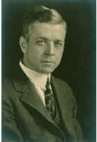
Rivers portrait-suit