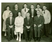
Rivers lab group