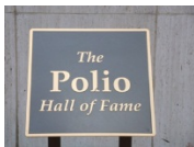
Polio Hall of Fame 4