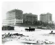
Founders Hall, Rockefeller Institute, ca 1920s