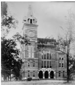
Emory 1908