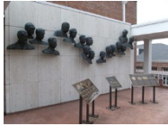
Polio Hall of Fame 2