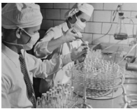
Technicians Injecting Polio Virus Into Test Tubes