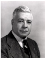
Thomas Rivers portrait, APSimg751