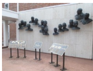
Polio Hall of Fame 3