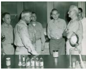
Rivers-Naval Research Unit