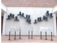
Polio Hall of Fame 1