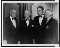
Justice Wiley Rutledge, Gov Dwight Green, Tom Clark, and Justice Harold Burton, 1945