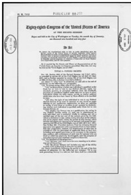
Civil Rights Act 1964