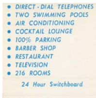
Heart of Atlanta Matchbook 2