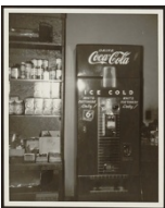
Coca-Cola machine labeled white customers only