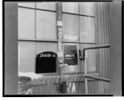
Bethlehem-Fairfield shipyards drinking fountain

September 5, 1956: Heart of Atlanta Motel