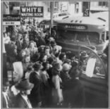
Bus at the Memphis station