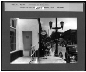
Racial segregation