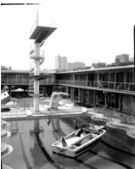
Speedboat with woman in bathing suit at Heart of Atlanta motel, Febuary 27, 1960