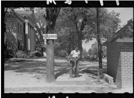
Drinking fountain on the county courthouse lawn