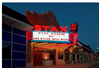
Stax Museum of America Soul Music LC-DIG-highsm-04867