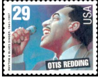
Otis Redding Stamp Courtesy of Ed Jackson