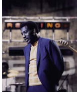
Otis on the set of Ready Steady Go!, September 16, 1966 3