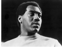
Otis on the set of Ready Steady Go!, September 16, 1966 2