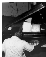
Otis at Piano, Macon, Georgia, ca 1964