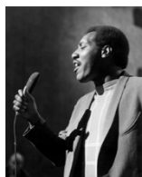
Otis on the set of Ready Steady Go!, September 16, 1966