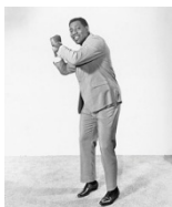
Otis Redding