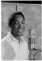
Sam Cooke