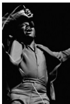
American Singer Otis Redding