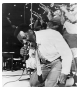
Otis performing at Atlanta Stadium, 1966