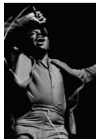
Early Promotional Photo, ca 1966