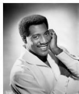
Little Richard