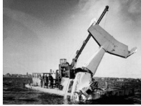
Pulling Otis Redding's Wrecked Plane from Lake