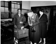
African American Voters, Ca. 1946