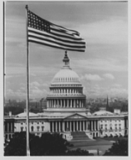
U.S. Capitol Building Black and White