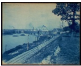
Rockford Illinois, from college grounds