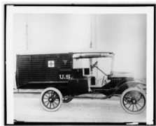
Operating Ambulance, France Library of Congress, Prints & Photographs Division, LC-DIG-npcc-31086