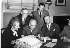
Georgia Women Achievement, Helen 2