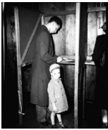
African American Father voting, Ca. 1946