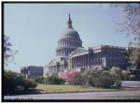
U.S. Capitol building Library of Congress, Prints & Photographs Division, LC-H8-CT-C01-072