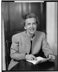
Helen Douglas Mankin