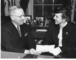
Georgia Women Achievement, Mankin and Truman