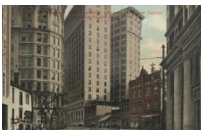
Downtown Atlanta, 1361PC-01 Post Card Collection