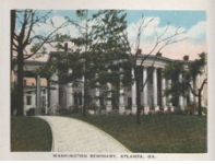
Stone Mountain Folder2-Seminary and Mosque, 1361PC-01 Post Card Collection, Courtesy of the Georgia Historical Society