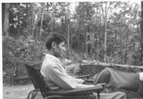
Reece 1955 unknown