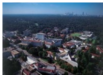
Emory University Aerial View