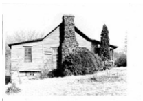
Old Byron Herbert Reece House Circa 1959