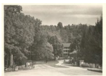
Young Harris College Circa 1930-1950