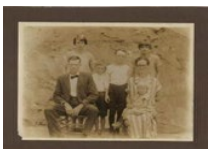
Reece Family Circa 1925