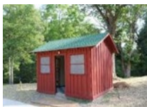
Reece Writing Studio Restored by the Byron Herbert Society