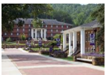
Young Harris College Plaza 2011