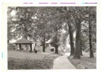
Young Harris College Circa 1930-1950, View 2