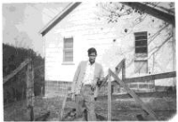
Reece 1955 unknown 4