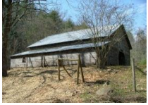
Byron Herbert Reece Farm