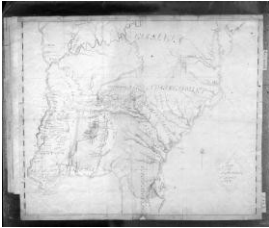
Map of the Southern Indian District , Map Collection, 1361MP-347