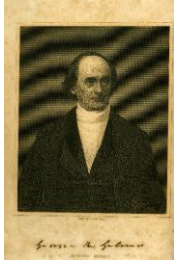
George Gilmer, Sketches of some of the first settlers of upper Georgia, of the Cherokees, and the author by George Gilmer. Rare Book, F289 G48 1855