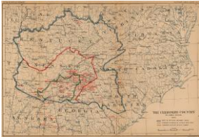
Cherokee Country 1900 Myths of the Cherokee , by James Mooney. Rare Book E99. C5 M763 1902