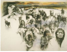
Cherokee Indians are forced from their homelands during the 1830s