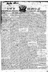
The United States of America to the State of Georgia, The Cherokee Phoenix, 17 December 1831, pg 1, Presented Online by the Digital Library of Georgia