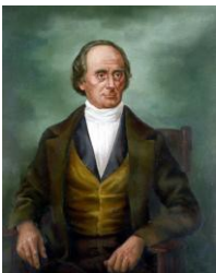
George Gilmer, 1992.23.0027