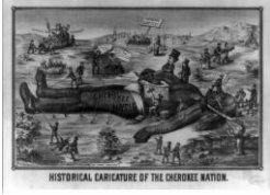
Historical Caricature of the Cherokee Nation