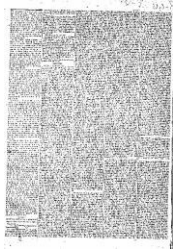
Georgia, Gwinnet County, The Cherokee Phoenix , 7 October 1831, pg 2 Presented Online by the Digital Library of Georgia