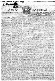
The Missionaries Imprisoned, The Cherokee Phoenix, 12 November 1831, pg 1 Presented Online by the Digital Library of Georgia