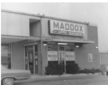
Maddox headquarters 1966 , VIS1050502