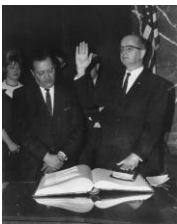
Maddox Inauguration, VIS1050422