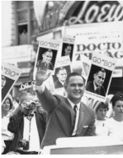
Bo Callaway 1966