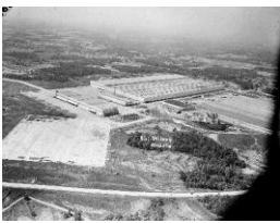
Bell Bomber plant, 1946