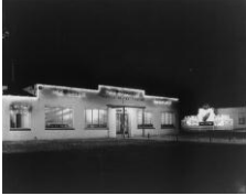
Pickrick at night, VIS1050609