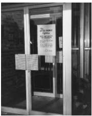
Pickrick No Integrationists, VIS1050606