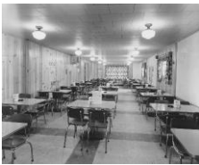
Pickrick Interior, VIS1050611