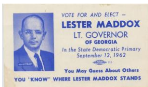
Maddox Lieutenant Governor Campaign, 1962