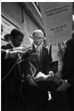
Maddox pickets AJC 1964, VIS9910301