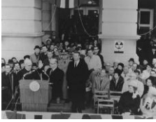
Maddox Inauguration at capitol 1967, VIS1050432