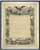
Emancipation Proclamation Library of Congress, Prints and Photographs Division, LC-DIG-pga-04067