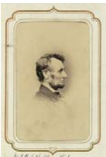
Lincoln Portrait from 1864 Library of Congress, Prints and Photographs Division, LC-DIG-ppmsca-19203