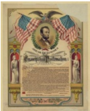
Emancipation Proclamation Library of Congress, Prints and Photographs Division, LC-DIG-pga-02797