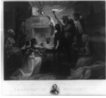
African Americans reading emancipation proclamation