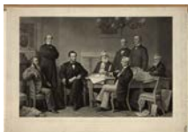
The first reading of the emancipation proclamation before the cabinet