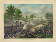
Battle of Antietam, 1862 Library of Congress Prints and Photographs Division, LC-DIG-pga-01841