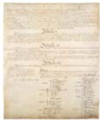
U.S. Constitution Signatures