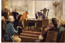
The Foundation of American Government