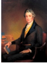
Abraham Baldwin Official Portrait