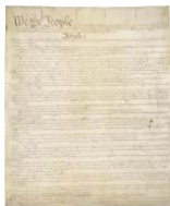
U.S. Constitution, Article 1 Accessed from the National Archives "Charters of Freedom" http://www.archives.gov/exhibits/charters/constitution_zoom_1.html