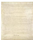
U.S. Constitution, Article 2 Accessed from the National Archives "Charters of Freedom" http://www.archives.gov/exhibits/charters/constitution_zoom_2.html