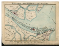
Map of siege of Fort Pulaski, Savannah River Georgia, 1862