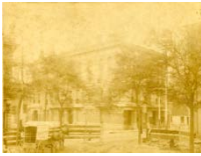
Savannah Volunteers building