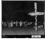
KKK cross burning, Burke County