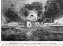
Bombardment of Fort Pulaski

Georgia Historical Society Collection of Photographs, 1361PH 20 27 4176