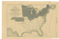
Map of the U.S. 1861 Library of Congress, Prints and Photographs Division, Civil War Photographs, LC-DIG-ppmsca-19483