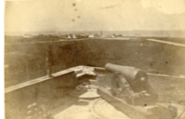
Guns on the walls