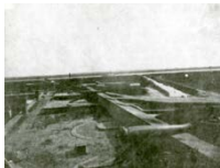
Guns on top of the walls