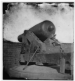
Fort Pulaski, The "Jeff Davis" gun

Library of Congress, Prints and Photographs Division, Detroit Publishing Company Collection, LC-D4-70130