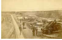
Guns on the walls

Georgia Historical Society Collection of Photographs, 1361PH 20 28 4208