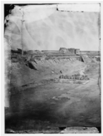
Fort Pulaski, Interior view of rear parapet

Library of Congress, Prints and Photographs Division, Civil War Photographs, LC-DIG-cwpb-00781