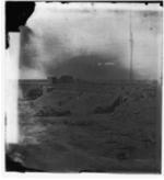
Fort Pulaski, Interior view