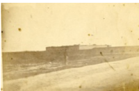
Fort Pulaski in the background circa 1862