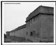
Fort Pulaski, outer wall

Library of Congress, Prints and Photographs Division, Civil War Photographs, LC-DIG-cwpb-00782