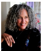
Charlayne Hunter Gault