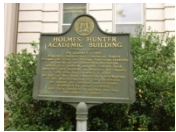
Hunter Holmes Academic Building marker