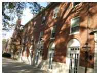
Meyer Hall Front 1