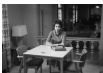
Charlayne Hunter Gault