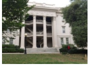
Hunter Holmes Academic Building 1