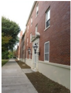
Meyer Hall Front Side View