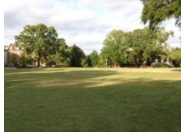
Quad behind Meyer Hall