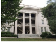
Hunter Holmes Academic Building 2 Courtesy of Sophia Lee