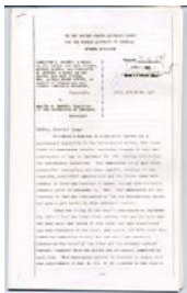
Bootles order to integrate January 6, 1961