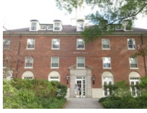
Meyer Hall Front 2