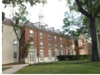
Meyer Hall Front 3