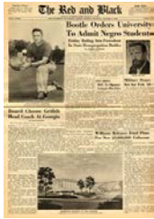
“Bootle Orders University to Admit Negro Students”, The Red and Black , January 5, 1961, 1