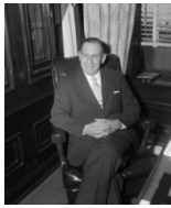
Marvin Griffin, 1955