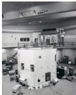
Neely Nuclear Reactor