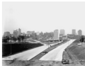
Interstate construction, skyline of Atlanta, 1960s