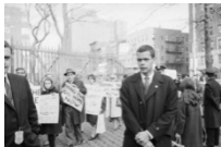
Julian Bond, 1966