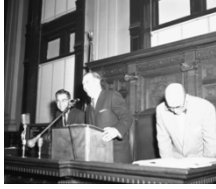
Governor Griffin addresses GA Assembly