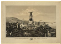
Reconstruction of the South, 1857

Image Courtesy of the Library of Congress, Prints & Photographs Division, Brady-Handy Collection, LC-DIG-cwpbh-00556