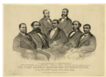
The First Colored Senator and Representatives in the 41 st and 42 nd Congress of the United States

Life and Times of Henry M. Turner – by Mungo M. Ponton, Rare Collection, BX8449 .T87 P65 1917. Book Courtesy of the Georgia Historical Society