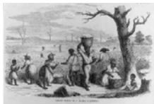
Slaves, picking cotton on a Georgia Plantation