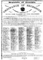
Ordinance of Secession Presented Online by the Digital Library of Georgia