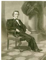
Alexander Hamilton Stephens