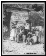
Slaves, five generations, 1862 Library of Congress, Prints and Photographs Division, Civil War Photographs, LC-B8171-152-A