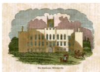
Georgia State capitol in Milledgeville

Library of Congress, Prints and Photographs Division, Civil War Photographs, LC-DIG-ppmsca-22479