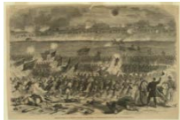
Battle of Fredericksburg