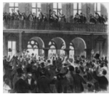
Secession meeting in front of the Mills House