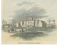
Georgia State capitol in Milledgeville Georgia Historical Society Print Collection, 1361PR 03 09b Courtesy of the Georgia Historical Society