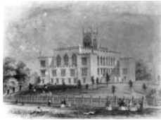
Georgia State Capitol in Milledgeville, drawing, 1361PH-17-08-3545