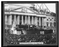
Inauguration of President Lincoln 1861 Library of Congress, Prints and Photographs Division, LC-USZ62-22734