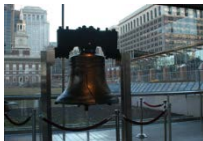
Liberty bell Pavilion, 2003

VIS145010001