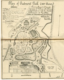
Map of Piedmont Park