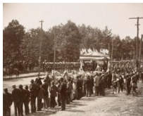
Liberty Bell Parade