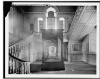
Liberty Bell and Stairway, Independence Hall