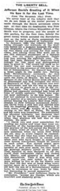
Jefferson Davis Greeting of It When He Saw it for the Last Time

Article courtesy of the New York Times, 1902