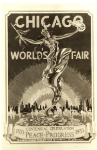
Worlds Fair Poster, Century of Progress

Image courtesy of the Georgia Historical Society, Rare Book Collection, RB T427 A1 C85 1895