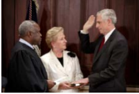
John Danforth Is Sworn In as New US Ambassador to the United Nations