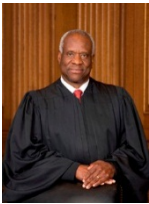
Official Justice Thomas Photo