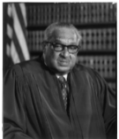
Official Portrait of Justice Marshal, 1976