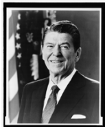
Ronald Reagan, portrait Image courtesy of the Library of Congress, Prints & Photographs Division, LC-USZ62-13040