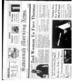
"2nd Woman to Face Thomas" October 10, 1991, page 1A