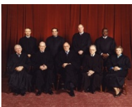
Supreme Court, 1991