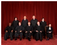
Full Court photo 2010