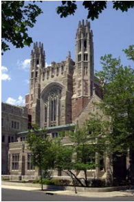
Yale Law School