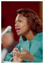
Anita Hill Testifies, 1991