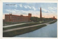
Sibley Cotton Mill, 1361PC-02-AugustaFolder5