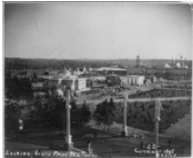
Aerial Shot from bell tower, Library of Congress, Prints & Photographs Division, LC-USZ62-70208