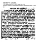
"Henry W. Grady." The Atlanta Journal Constitution , March 26, 1876, pg 3.