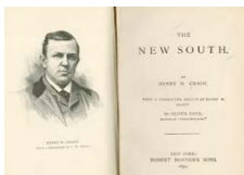
Inside Cover, The New South . Main Collection F.215 G732 1904