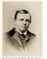
Henry W. Grady Henry Woodfin Grady Papers, 1828-1971