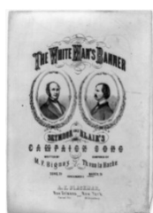
White Mans Banner Campaign Song 1868