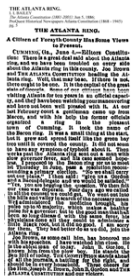
"The Atlanta Ring," The Atlanta Journal Constitution , June 5, 1886, pg 5