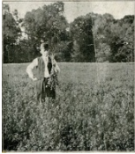
Alfalfa Farmer, Vertical Files (Agricultural Pamphlets)