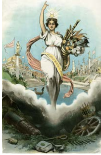
New South Female Image, L1979-40_12