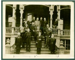
Grady in Top Right Corner Henry Woodfin Grady Papers, 1828-1971