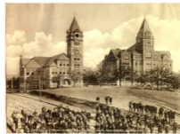
Georgia Tech Academic Building, 1900