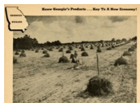
Peanut Farm, Vertical Files (Agricultural Pamphlets)