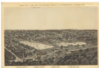
Bird's Eye View of the Cotton States and International Exposition, 1895