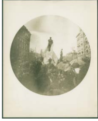
Crowd at Henry Grady Monument Unveiling Henry Woodfin Grady Papers, 1828-1971