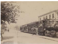
Coast Line Railroad train, ca 1890, Manuscript Collection 1375-280