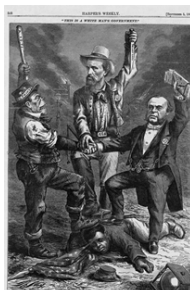
Mitchell County Whites Stepping on Black Citizen "This is a White Man's Government." Harpers Weekly. September 5, 1868, p.568.