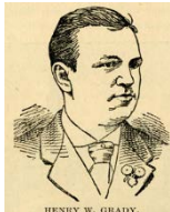
Henry Grady Sketch, Main Collection F.294 C8 A2