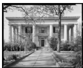
Henry Grady Home

Permission of the Georgia Institute of Technology Library and Information Center, Archives and Records Management Department