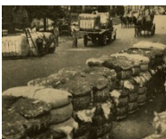
Crop, Augusta Farmer's Market, Vertical Files (Agricultural Pamphlets)