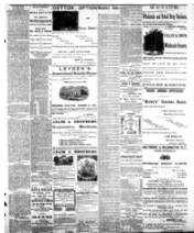
"New South," The Atlanta Daily Herald , March 14, 1874 Presented online by the Digital Library of Georgia