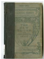
Cover, The New South . Main Collection F.215 G732 1904