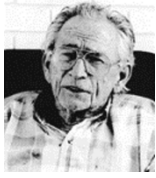
Howard Finster 1