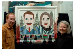
Earth, Heaven, Hell