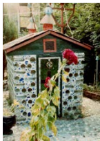
Sculpture at the Paradise Gardens