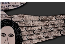
Big Angel From Garden