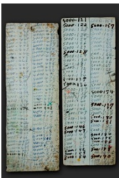
Works Number List