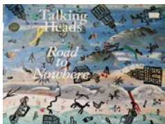
Talking Heads, Road To Nowhere album cover