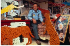
Cheetahs and Finster