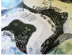
Reckoning album cover (close up), REM