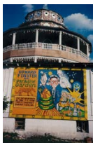
Paradise Garden tower