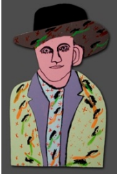
Howard's Last Painting