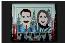
Earth, Heaven, Hell