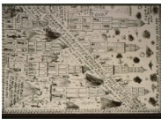
City of Morlatia, 1985 Lithograph on Paper 25 x 18 inches Telfair Museums, Savannah, Georgia Museum Purchase, 1994.7.17