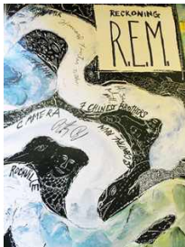
Reckoning album cover, REM