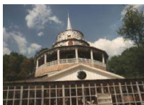
Paradise Garden tower