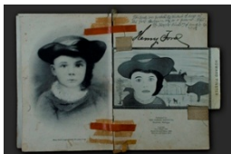
Henry Ford Book