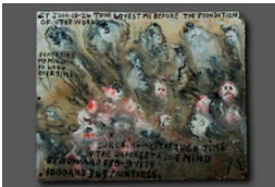
Scattering My Mind to Look Over Time