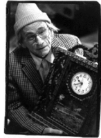
Howard Finster 2