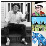
Howard Finster 3