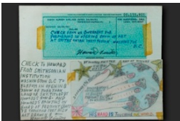
Drawing and Check for the Smithsonian