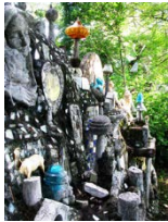
Finster sculpture at the Paradise Gardens