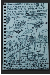
Drawing Howard Did Before a Flight