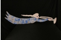
Blonde Angel