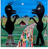
The Super Powers (4581), 1985, tractor enamel on wood