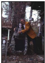
Howard Finster at Paradise Gardens