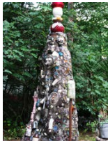
Finster sculpture at the Paradise Gardens