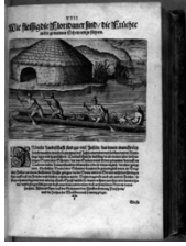
Early Coastal NA, ca 1500s

Library of Congress, Rare Book & Special Collections Division