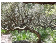
Cumberland Island Maritime Forest 1