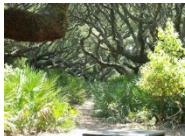
Cumberland Island Maritime Forest 2