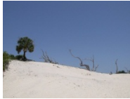
Cumberland Island Beach 02