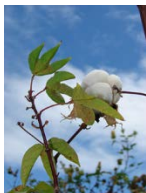
Sea Island Cotton Plant