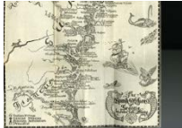
Map of Spanish Missions in GA view 1, Rare Book Collection, F 289 L55 1935

Library of Congress, Rare Book & Special Collections Division