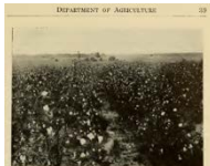
Sea Island Cotton Field , "Growing Cotton Under Florida Condition," Florida Department of Agriculture Report 1938