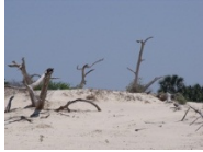
Cumberland Island Beach 01