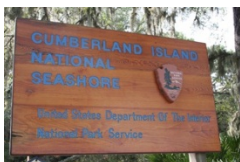
Cumberland Island National Seashore Welcome Sign www.wildcumberland.org