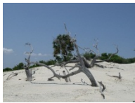
Cumberland Island Beach 03