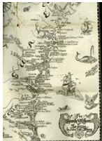
Map of Spanish Missions in GA view 2, Rare Book Collection, F 289 L55 1935