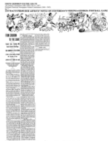
“From Gridiron to the Grave”

Article courtesy of the Atlanta Journal Constitution, October 31, 1897, page 7