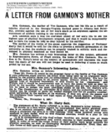
“A Letter from Gammons Mother”

Article courtesy of the Atlanta Journal Constitution, November 5, 1897, page 5