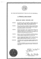
A Proclamation by Rosalind Burns Gammon Day