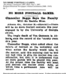
No More Football Games Article courtesy of the Atlanta Journal Constitution, November 1, 1897, page 2