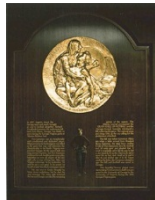
Butts Mehre plaque

Article courtesy of the Atlanta Journal Constitution, November 1, 1897, page 2