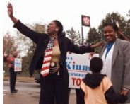
Cynthia McKinney on 1996 campaign