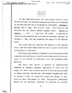
Court Order determining 11th Congressional District of Georgia Unconstitutional, page 2