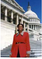
Cynthia McKinney, on the steps of the Capitol, DC, c1999