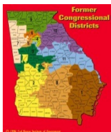
1996, 11th Congressional District