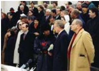
Cynthia McKinney, with fellow house members, c1999