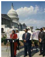
Cynthia McKinney, US Congress, c1999