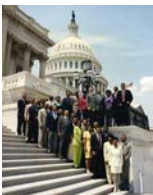
Cynthia McKinney, with Members of CBC, c1999