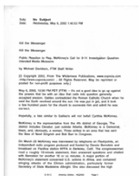
"Kill the Messenger", page 1