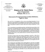
Statement of Congresswoman Cynthia McKinney, April 12, 2002, On 9-11 Investigation, page 1