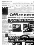
“Senate Passes Ethics Bill Emphasizing Disclosure” March 30, 2006 Article courtesy of the Savannah Morning News, http://savannahnow.com/