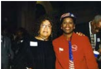
Cynthia McKinney, with a supporter, c1999