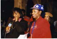
Cynthia McKinney with Channel News Reporter, c1999