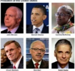
Presidential Candidates, 2008