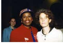
Cynthia McKinney, with Supporter, c1999