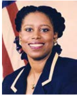
Congresswoman Cynthia McKinney, c1999