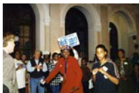
Cynthia McKinney, Election Night Victory, c1999