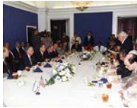
Cynthia McKinney, Foreign Relations, c1999