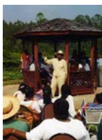
Cynthia McKinney, on Campaign trail, c1999