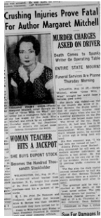
“Crushing Injuries Prove Fatal For Author Margaret Mitchell” August 17, 1949