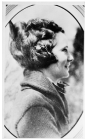
Margaret Mitchell, profile portrait