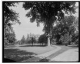
View of the grounds of Smith College, Northampton, Massachusetts