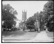
College Hall, Smith College Library of Congress, Prints & Photographs Division, LC-D4-17746