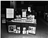
Gone with the Wind Premiere Anniversary Book Table Courtesy of Lane Brothers Commercial Photographers Photographic Collection, Special Collections and Archives, Georgia State University Library, LBMPE2-003a