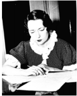
Margaret Mitchell writing