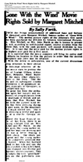
“Gone With The Wind’ Movie Rights Sold by Margaret Mitchell”