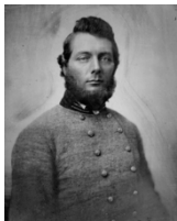
Margaret Mitchell Grandfather