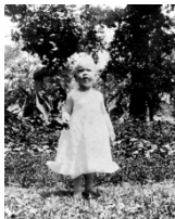
Margaret Mitchell as a Toddler