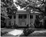
Exterior view of Margaret Mitchell Peachtree House