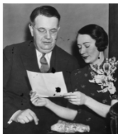
Margaret Mitchell reading Pulitzer announcement with manger