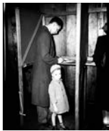
African American voter