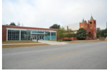
Albany Civil Rights Institute, Mt. Zion