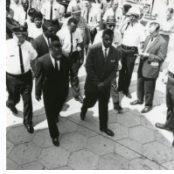
Martin Luther King being led away by police