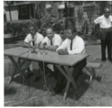
Martin Luther King being interviewed at picnic table in Albany