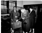
African American voters