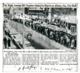
“Dr. King Among 265 Negroes Seized in March on Albany, GA City Hall”