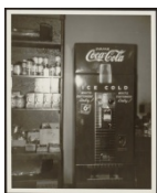
Coca-Cola machine labeled white customers only Library of Congress, Prints and Photographs Collection, LC-DIG-ppmsca-08128