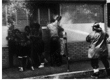
Protesters Being Hosed by Fireman 1963