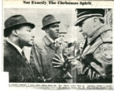
“Not Exactly Christmas Spirit” Police shaking fist at Martin Luther King