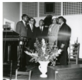
Martin Luther King with leaders of Albany Movement