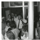
Albany 18