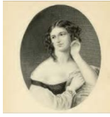
Fanny Kemble Engraving

Letters to Fanny Kemble, 1871 - 1883 (1902) by Edward Fitzgerald and William Wright. London: Macmillian (1902)