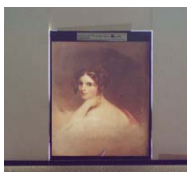
Fanny Kemble between 1900 -1920

Courtesy of the Georgia Historical Society