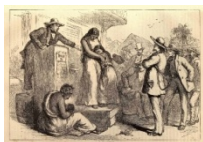
Slave auction Cassell's History of the United States by Edmund Ollier, Cassll, Fetter & Galpin (New York: ca.1878) Accessed on www.archive.org