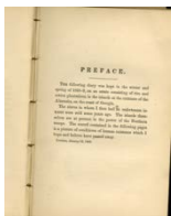
Journal of a Residence On a Georgia Plantation, Fanny Kemble, Preface, F290 K33