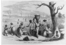
Picking Cotton on Georgia Plantation Library of Congress, Prints and Photographs Collection, LC-USZ62-76385