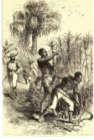
Slaves Working on Plantation

Cassell's History of the United States by Edmund Ollier, Cassll, Fetter & Galpin (New York: ca.1878)