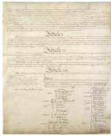
US Constitution page4