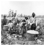
Cotton Picking, 1361 PH-01-01-0008