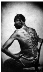
Scars of a Whipped Slave