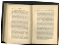
Letter to Times Concerning Uncle Tom's Cabin

Library of Congress, Prints and Photographs Division, LC-USZ62-112016