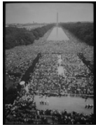
March on Washington

National Archives at College Park, College Park, Maryland