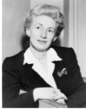
Lillian Eugenia Smith, 1944

Library of Congress, Prints & Photographs Division, LC-USZ62-109699