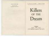
Killers of the Dream by Lillian Smith, title page