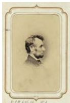
Lincoln Portrait from 1864

Library of Congress, Prints and Photographs Division, LC-DIG-pga-04067