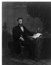
Abraham Lincoln signing the 13th amendment