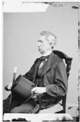
Secretary of State William Seward