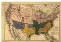
Map Showing all States under control Of Federal Union January, 1864

Library of Congress, Geography and Maps Division, G3701.S5 1864 .B3 CW 48