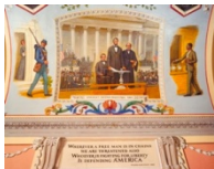
Lincoln's second inaugural 1865

Library of Congress, Prints and Photographs Division, LC-DIG-ppmsca-19203