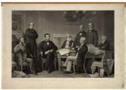
The first reading of the emancipation proclamation before the cabinet Library of Congress, Prints and Photographs Division, LC-DIG-pga-02502