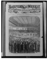
Scene in House of Representatives after passage of 13th amendment