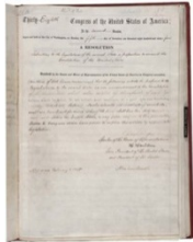
13 th Amendment

National Archives and Records Administration, Accessed through archives.gov