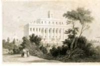
Georgia Female College, MS 1361-PR box 2 folder 81