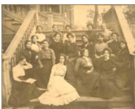
Part of Class of 1904