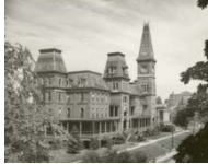
Wesleyan Female College