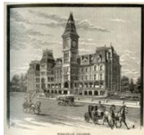
Wesleyan College, early drawing, A History of Georgia , Main Collection F286 E9 1908