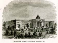
Wesleyan Female College, MS 1361-PR box 2 folder 81