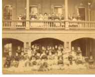
Student group