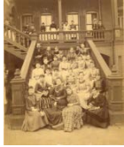
Students Wesleyan College Archives