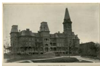
Wesleyan Female College, The Story of Georgia and the Georgia People , Main Collection F286 S66 1901