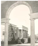
View of Candler Building from Loggia Wesleyan College Archives