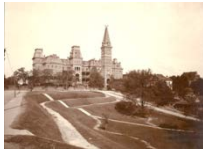
Wesleyan Female College, c 1900-1902